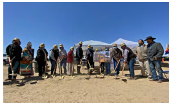
LaQuinta Hotel in Shonto ground breaking dedication